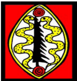
Aboriginal Legal Rights Movement Inc