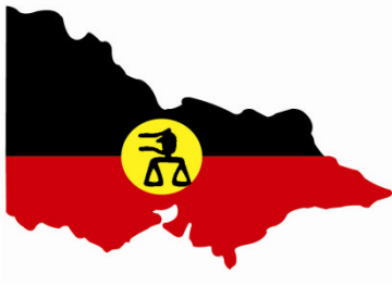
Victorian Aboriginal Legal Service Co-operative Ltd