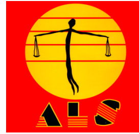
Aboriginal Legal Service of Western Australia