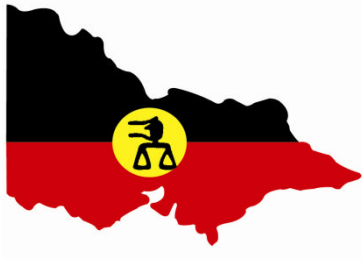
Victorian Aboriginal Legal Service Co-operative Ltd