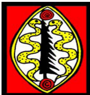
Aboriginal Legal Rights Movement Inc