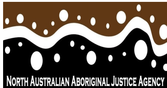
NORTH AUSTRALIAN ABORIGINAL JUSTICE AGENCY